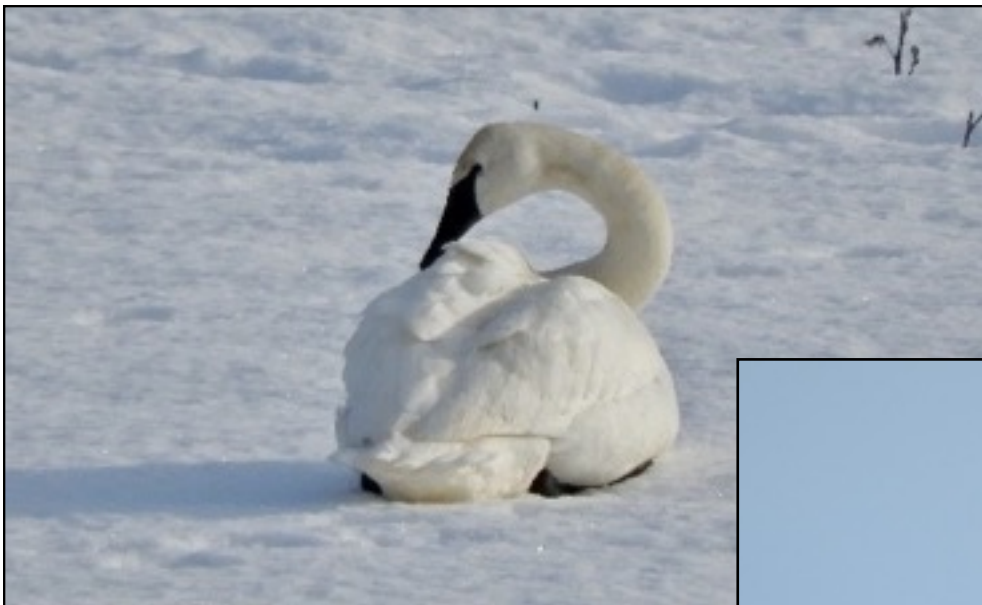
above: Trumpeter Swan, right: Bald Eagles